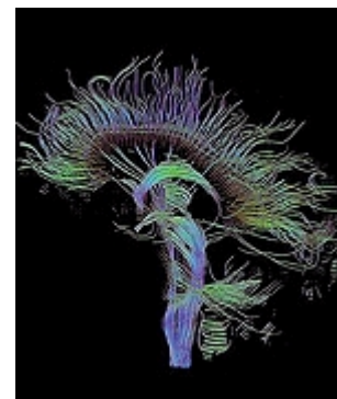
We can now see the nerve pathways as they make connections to different brain centers.